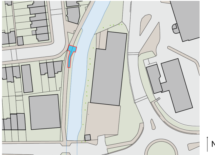
Figure 2: Existing Site plan showing London Borough of Merton land in question hatched blue

On completion of the S106 agreement with London Borough of Merton in October 2022, it was agreed that the Applicant would secure the footbridge necessary consents by way of best endeavours so that the footbridge could be delivered.